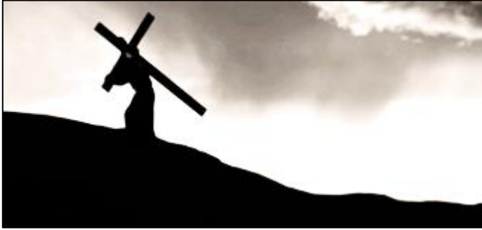
The cost of discipleship.