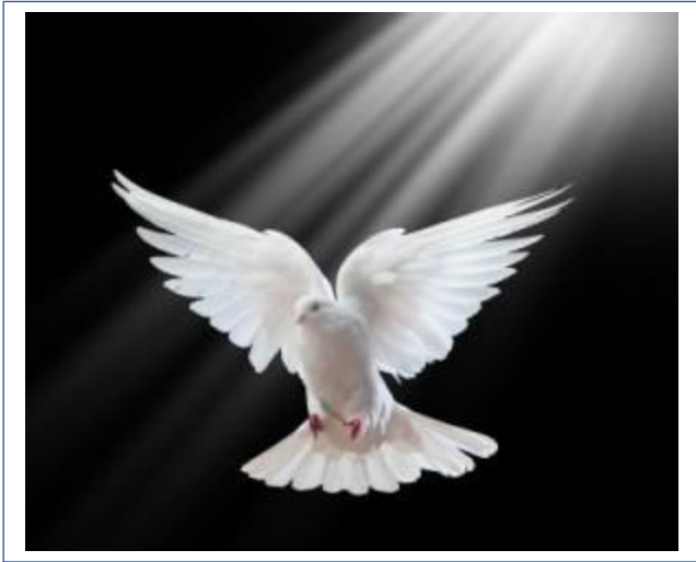
THEY WERE ALL FILLED WITH THE HOLY SPIRIT.