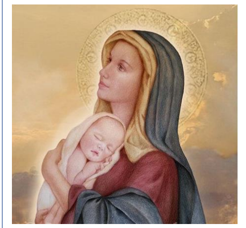
HOLY MARY, MOTHER OF GOD