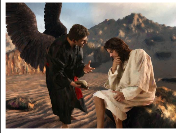
Jesus was tempted by Satan.