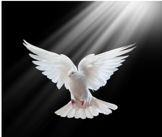
The Spirit of the Lord is Upon Me.