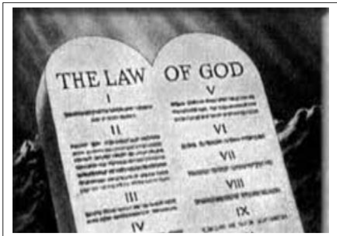
Keep the Commandments of the Lord.