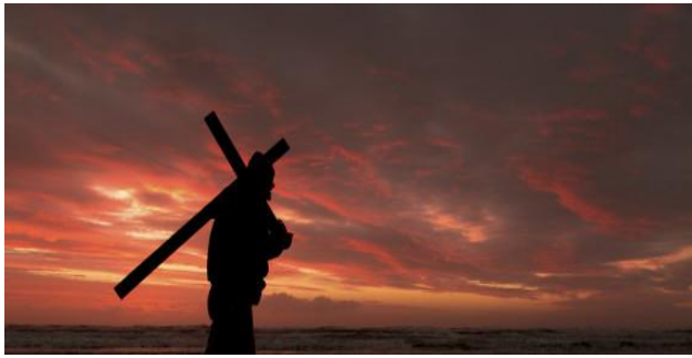
The weight of the Lenten cross.